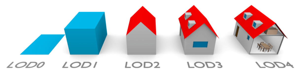
Figure 2: The five LODs of CityGML

Data may have several details that could be useful or not depending on the purpose. Therefore, the Hub includes the concept of Level of Detail (LoD). We use a very generic classification system to divide up data into levels of detail, following the idea used by CityGML of details in geometry. In that sense, geometry is classified in 5 levels (figure 2), and it is also possible to have intermediate levels. For example, an LoD 0.5 in geometry would be providing footprint (as in LoD 0) together with the building height, giving an idea of its 3D exterior aspect.